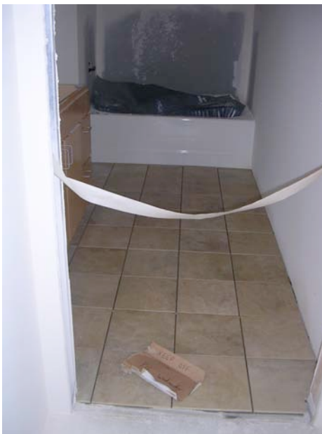
Unit 304 – Tile set in the master bath.