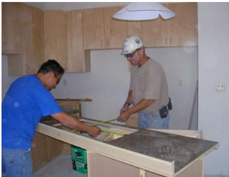
Unit 420 – Countertop being measured.