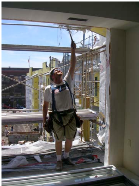
Unit 421 – Patio door frame going in.