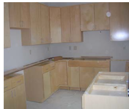
Unit 301 – Kitchen cabinets installed.