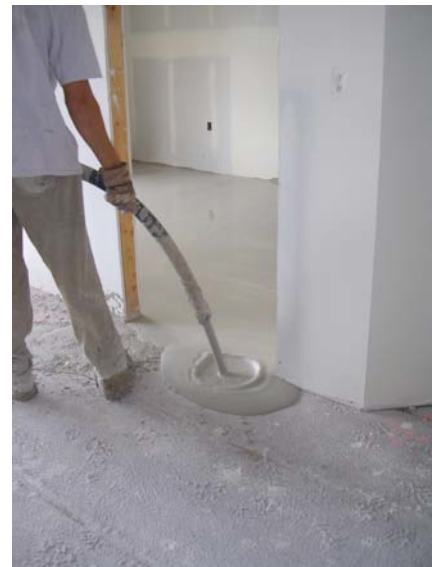
Unit 112 – Gyp-crete being poured.