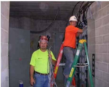
Electrician boys wiring in the basement.