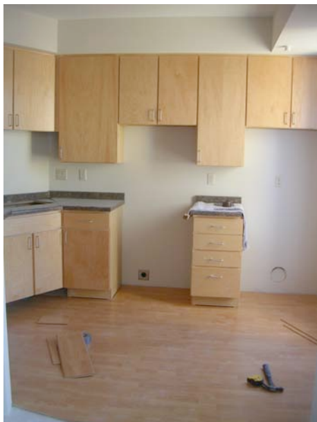
Unit 421 – Countertops and wood floors are in!