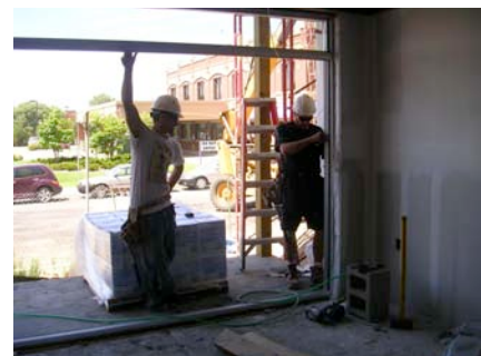
Unit 113 – Carpenters framing up the patio door.